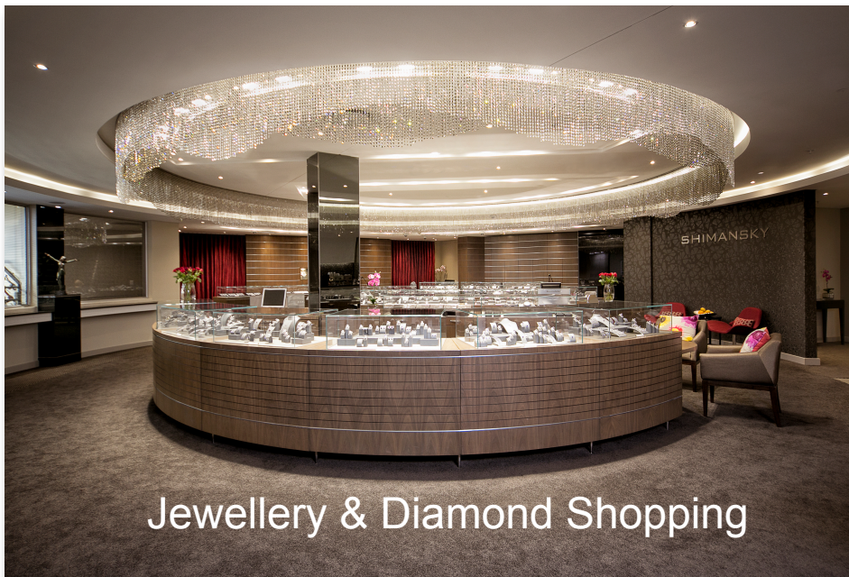
Jewellery & Diamond Shopping