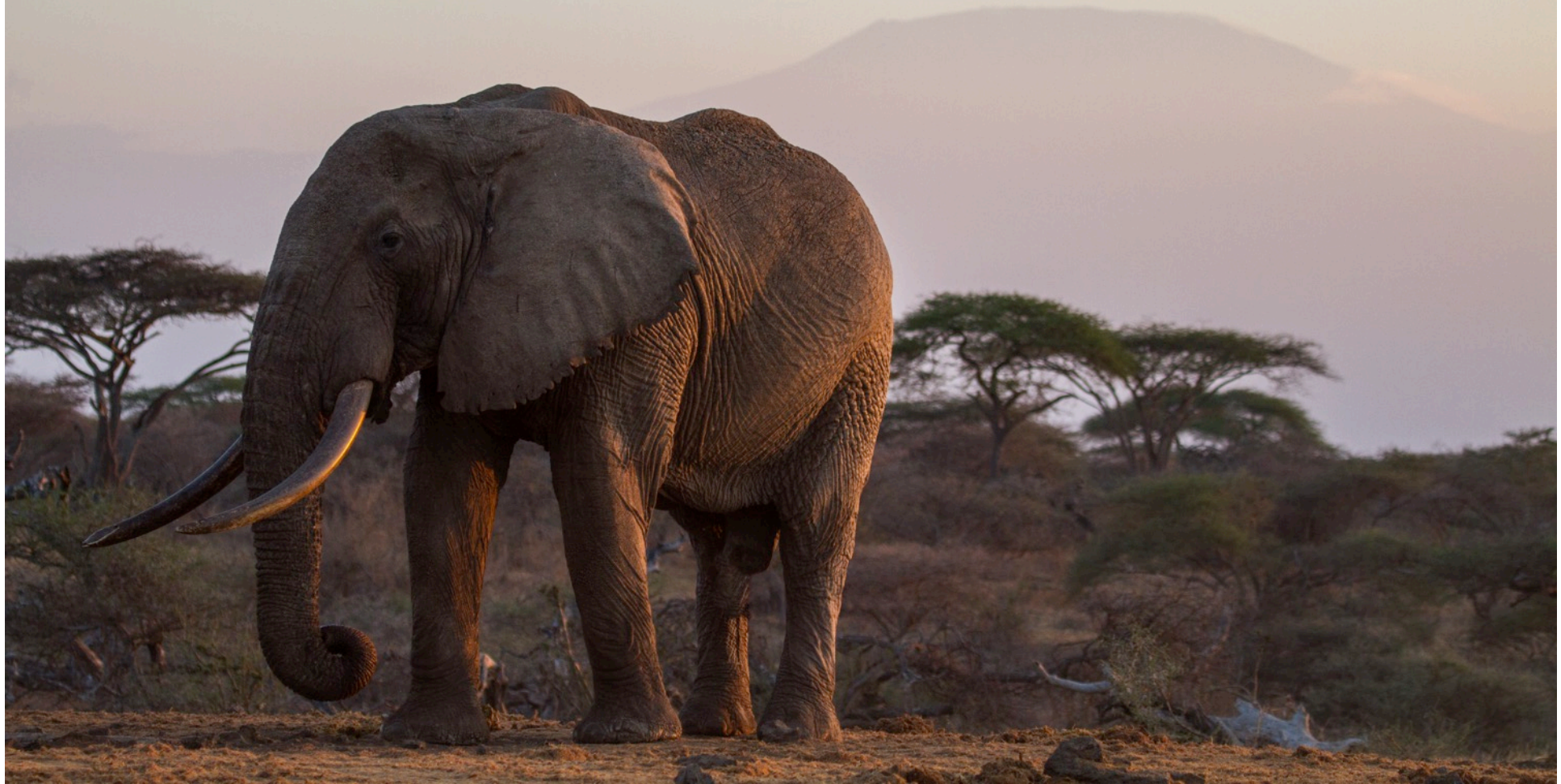
Big tusker at ol Donyo Lodge waterhole