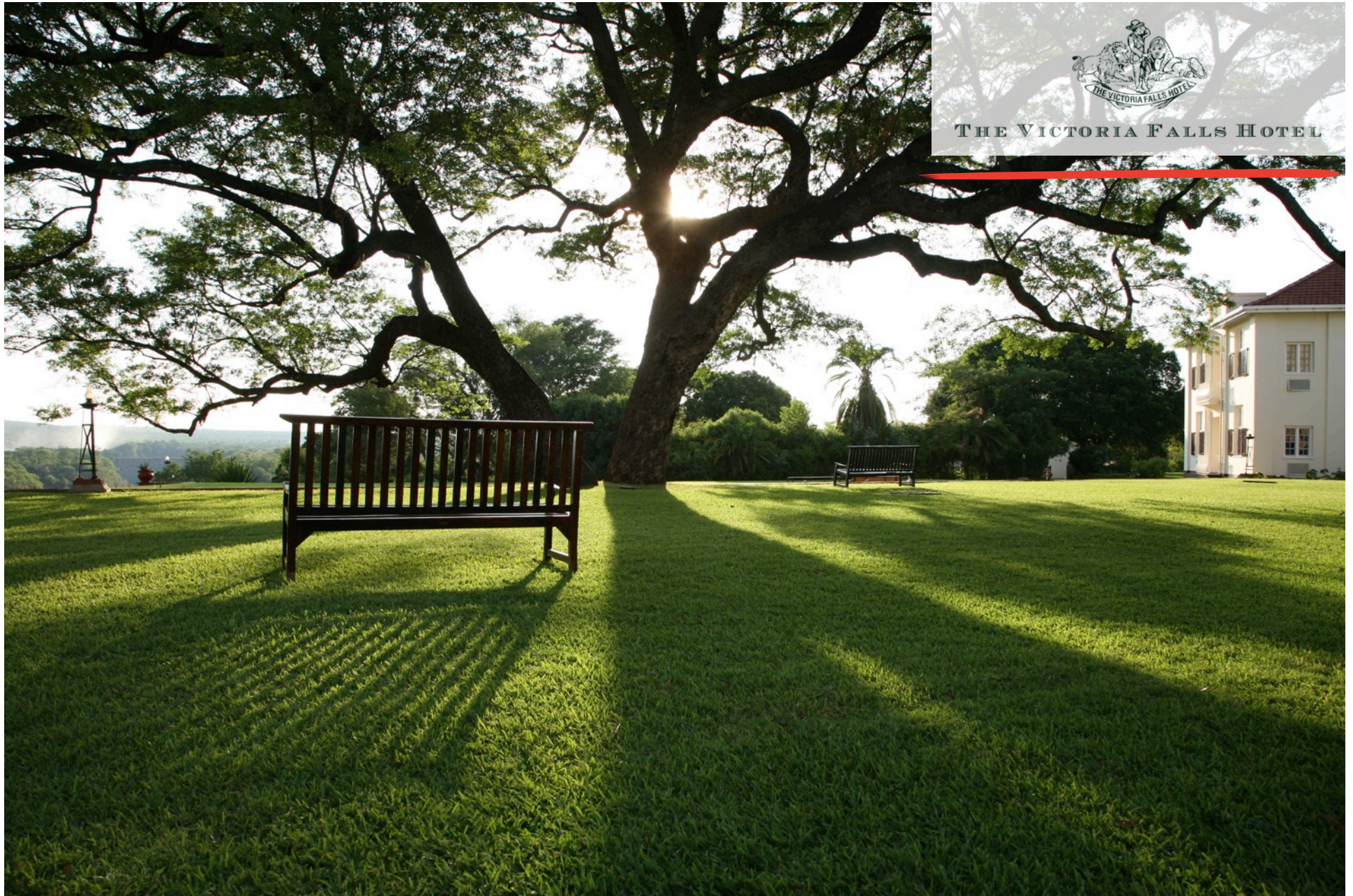
Early morning at The Victoria Falls Hotel

10 & 11 MAY 2018 – THE VICTORIA FALLS HOTEL