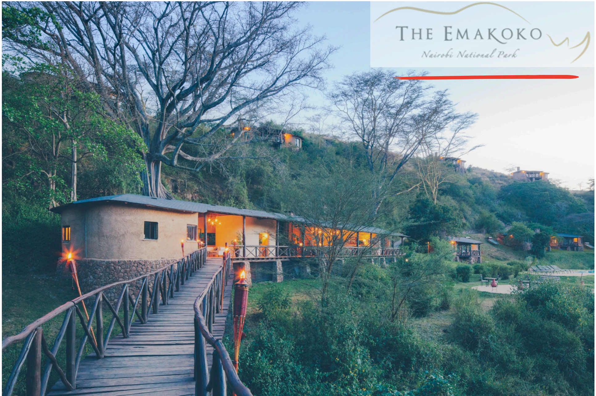
The Emakoko, overlooking Nairobi National Park