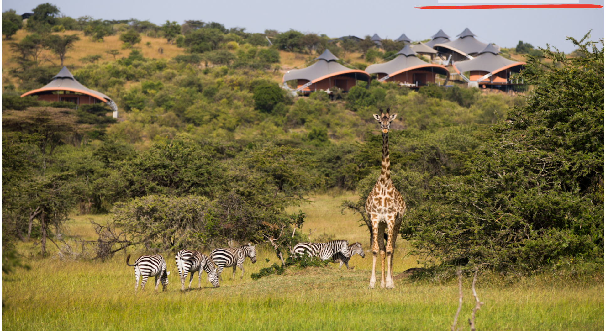
Mahali Mzuri in the Olare Motorogi Conservancy

SIR RICHARD BRANSON'S KENYAN SAFARI CAMP